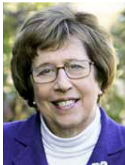
Senator Lois Wolk, California State Senate

REGISTER TODAY! 800-419-2741 <register@argentco.com>